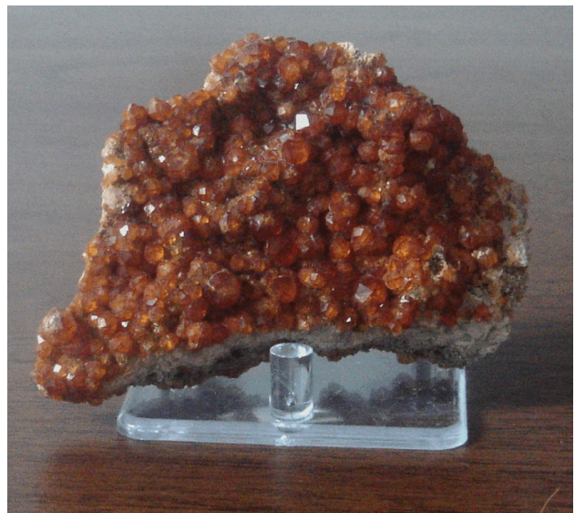
Spessartine, $60 specimen, about 3.5" across and 2" high.

SPESSARTINE* , Zhanghou Prefecture, Fujian Province, China. These are matrix pieces with the bright orange garnets from the exciting new find made in China a few years ago. Each matrix piece has many crystals about 1/8" to 3/16" with excellent burnt-orange color. We have matrix pieces about 3" by 1.5" to 3" by 2.5" and slightly larger for $40, $50, and $60.